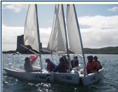
The children are taught yachting skills on the new equipment purchased with the help of LEADER

“The support and assistance provided by LEADER Innse Gall has been instrumental in the development of the Barra Watersports Club. We are looking forward to a busy summer season. The new boats and equipment will provide an excellent new facility for tourists and islanders alike and will give people the opportunity to enjoy the beautiful coastline which surrounds our islands”.