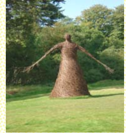
An Lanntair's 'Willow Woman' erected in the Castle Grounds, assisted by LEADER