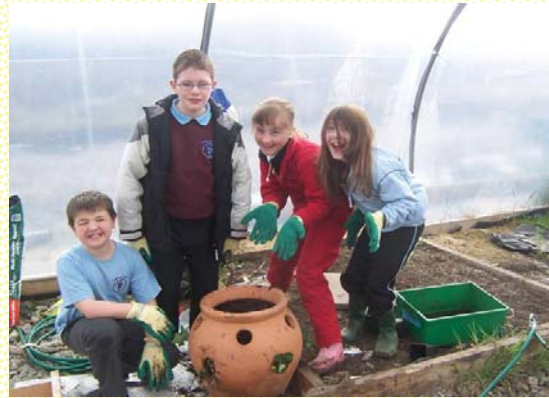
Children from Sgoil na Loch learn about the importance of organic growing

The assisted projects vary in the benefits that they offer from supporting renewable projects, such as assisting to provide electric community transport to supporting educational and training opportunities like Cothrom's 'Re-Store' project on South Uist. The Crofting Connections project, which is a Scotland-wide project, encourage young people in schools to learn about and become involved in crafting and horticulture, also benefited from LEADER funding.