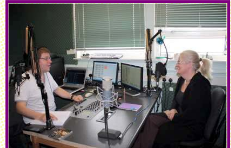
The communities of Barra & Vatersay were assisted by LEADER to develop a community owned and led Local Radio Station