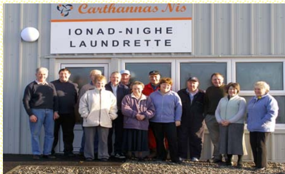
The dedicated volunteers of Carthannas Nis at the unofficial opening of the Laundrette.

“ I would like to thank LEADER Innse Gall for their support and assistance in bringing this project to fruition . We are confident that the laundrette will be a useful facility for the local community, businesses and holiday makers alike.