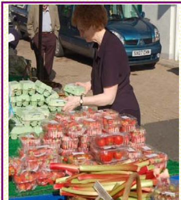
Just a small sample of the array of local produce available for purchase at the Farmers Market

"The support of LEADER for the Lewis and Harris Horticultural Producers Group market has been gratefully appreciated. The market had been running for a number of years for the benefit of local producers who are members of the group. The funding has been used to buy some new equipment for the market and to enable additional markets to be run. A Development post is part funded by LEADER and has resulted in a significant increase of total sales around 35% in 2010 based on previous years.